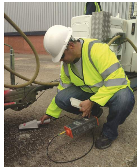
Fig. 2 - Radiological monitoring was completed throughout the project.