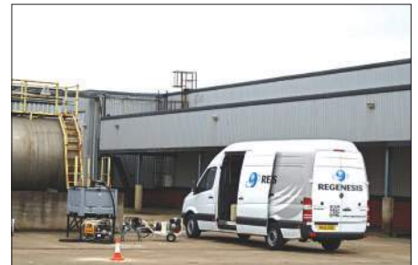
Fig. 1 - The former engineering works

RegenesiS then provided a remediation design using ORC Advanced to provide a controlled release of dissolved oxygen into the groundwater for a period of 9 to 12 months from a single injection in order to stimulate and maintain accelerated natural attenuation of the contaminants of concern (COCs).