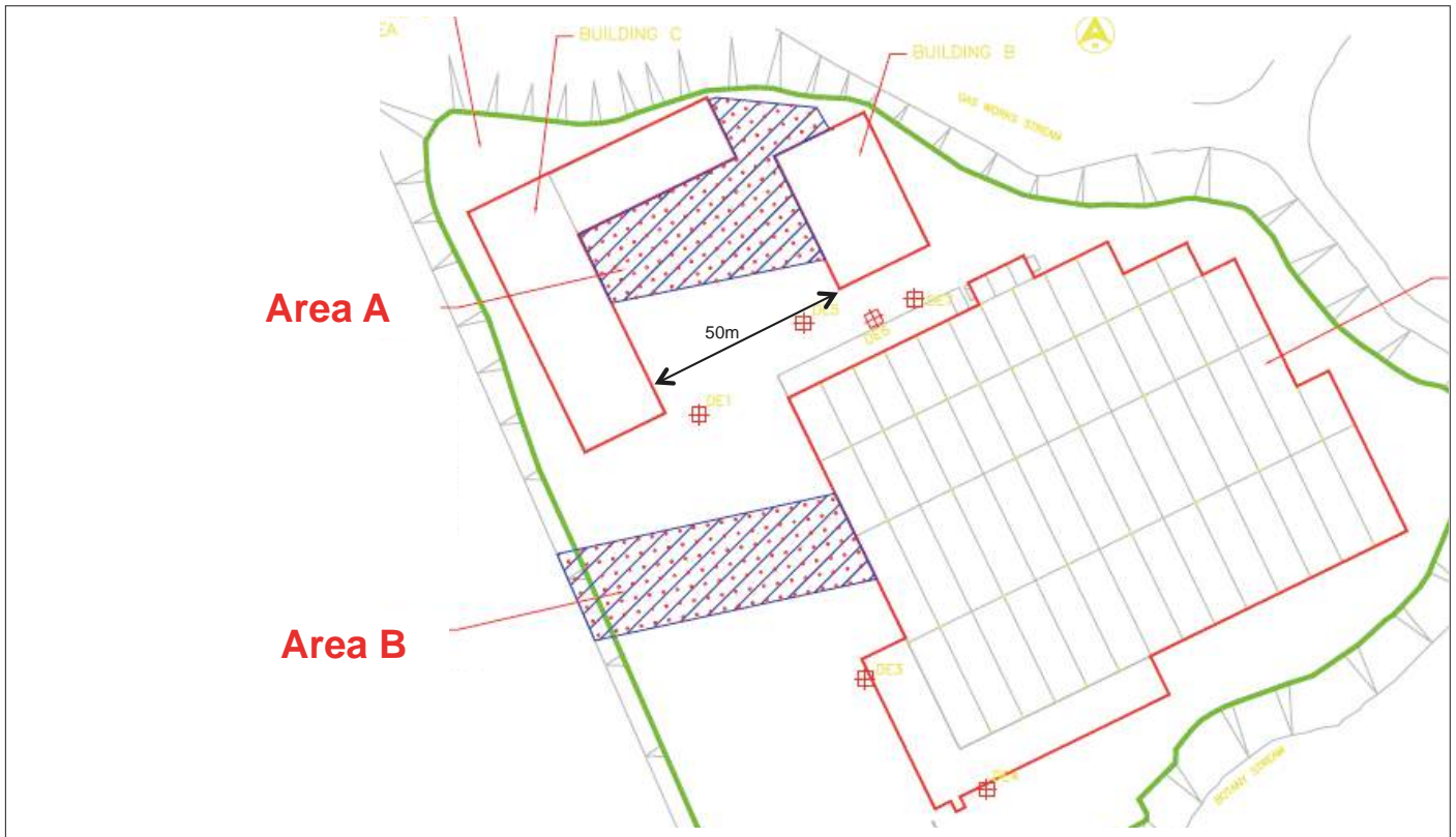
Fig 3. - Site Map showing the two application areas