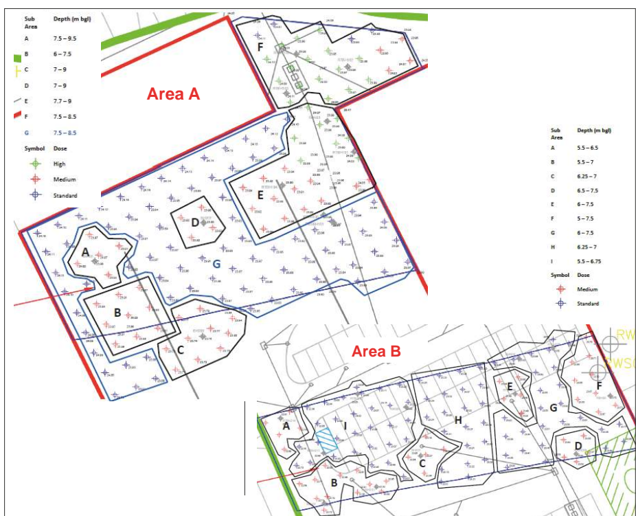
Fig 8 - Map showing the refined dosage designs for Area A and B