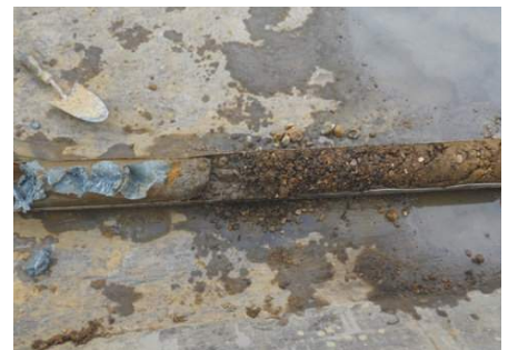
Fig 6 and 7 - Confirming the CSM