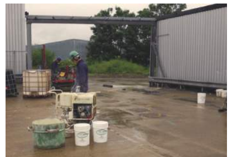
Fig. 5 - ORC-A pilot test application in Area A