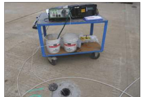
Fig. 4 - Pumping and dye test