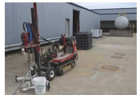
Fig 9-11 - Application on site