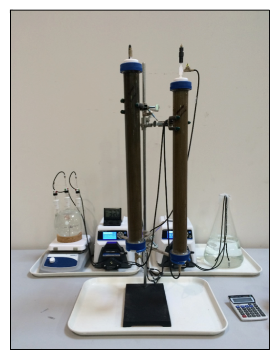
Figure 1. O -Xylene column study set-up

327 g of 0.2% PlumeStop colloidal suspension were then added to the head of the test column followed by continued elution with the o -xylene solution. For the control column, the o -xylene solution was eluted without interruption. O xylene concentrations in the effluent of each column were recorded at intervals of 1 - 3 days through the duration of the six-week study.