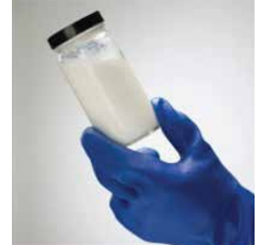
Example of 3-D Microemulsion

For a list of treatable contaminants with the use of 3DME, view the Range of Treatable Contaminants Guide