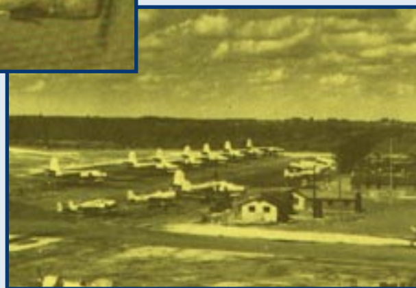
Historical images of Millville Airport