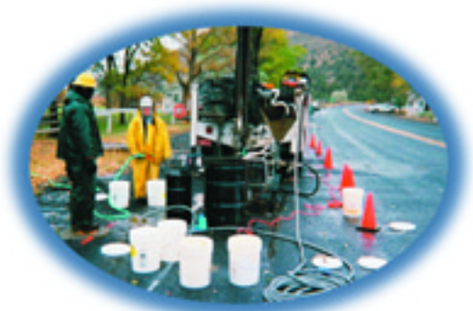
RegenOx product application