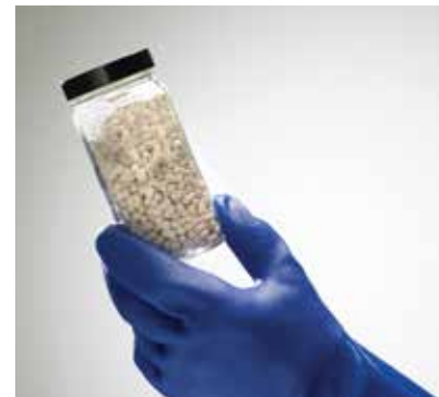
Example of ORC Advanced Pellets

Oxygen is released from ORC Advanced for a period of 9 to 12 months in situ .