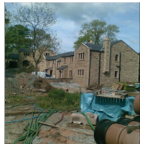
Figure 1. Successful remediation leads to luxury residential housing redevelopment of the site