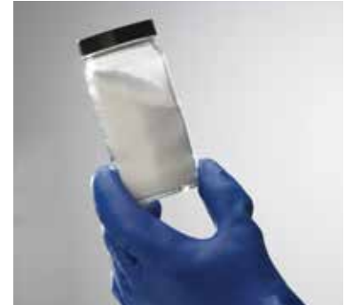
Example of PersulfOx