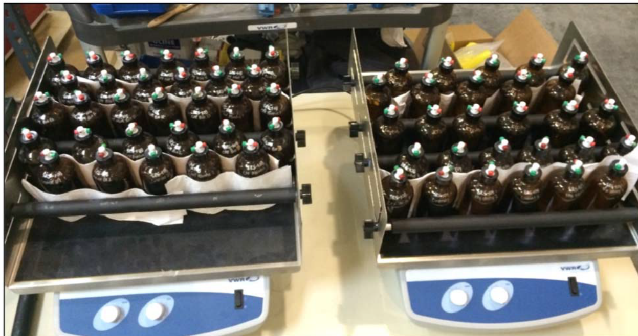
Figure 1. Batch-Equilibrium Study – Experimental Set-up

The conditions were tested in parallel and run over a period of 28 days. Microcosms were sampled destructively in triplicate on days 1, 7, 14, 21, and 28. Benzene was quantified in the aqueous phase and also as a mass-balance extract of the total soil-water system (i.e. the aqueous and solid-phase microcosm contents together).