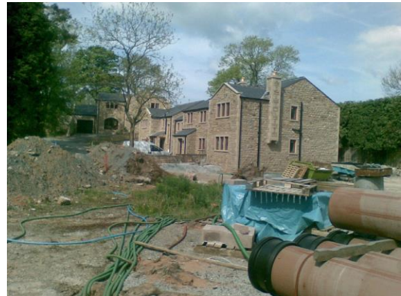
Figure 1. Successful Site Remediation Leads to Luxury Residence Redevelopment

When redevelopment of an old service station was proposed, site investigations revealed a significant petroleum hydrocarbon impact within the soil and groundwater. The subsurface contamination threatened to derail the redevelopment program and a rapid remediation strategy was needed to reduce concentrations to acceptable levels. Geo 2 Remediation was contacted to remediate the site in order to allow safe development for luxury residential properties while ensuring no impact to local protected controlled waters.