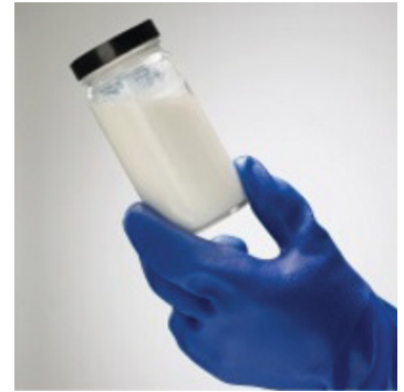
Example of 3-D Microemulsion

For a list of treatable contaminants with the use of 3DME, view the Range of Treatable Contaminants Guide.