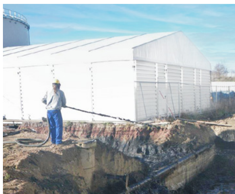
A field services applicator spray-applies PetroFix to the walls and base of the excavation.