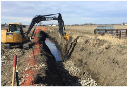
Backfilling of irrigation ditch following PetroFix application.