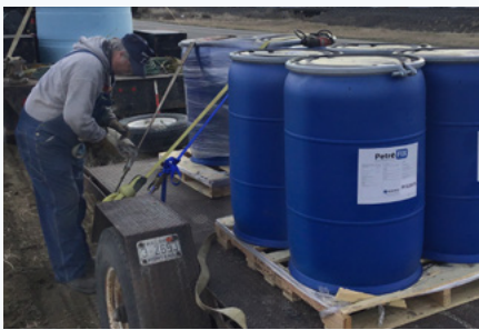
PetroFix is delivered to the site.

PetroFix is spray-applied into the excavated irrigation ditch.