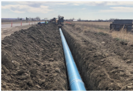
New irrigation pipe installed following PetroFix treatment and backfilling.