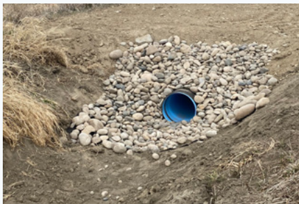
Completed installation of the pipe section.