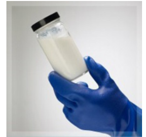
Example of 3-D Microemulsion

For a list of treatable contaminants with the use of 3DME, view the Range of Treatable Contaminant Guide .